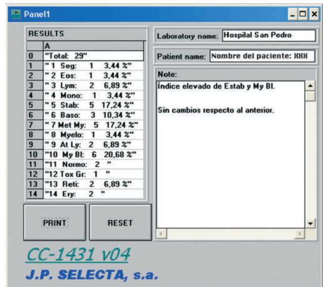
Software download and report.